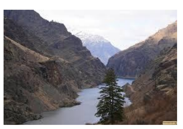
Multnomah Falls Roque River Hell's Canyon