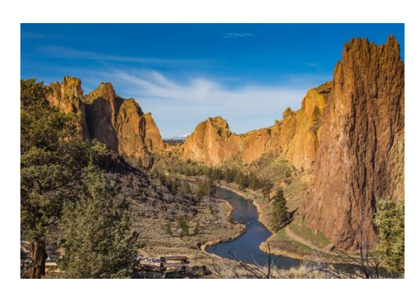
Smith Rock State Park